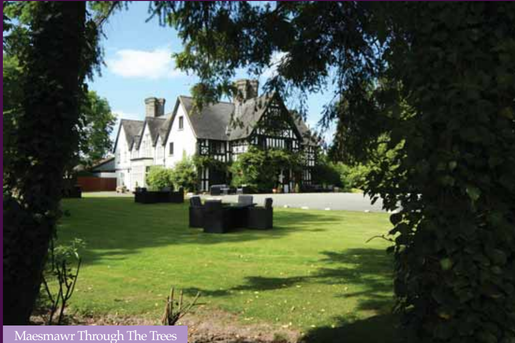
Maesmawr Through The Trees

Enjoy all this land of song has to offer and be sure of a 'Happy Ending'.