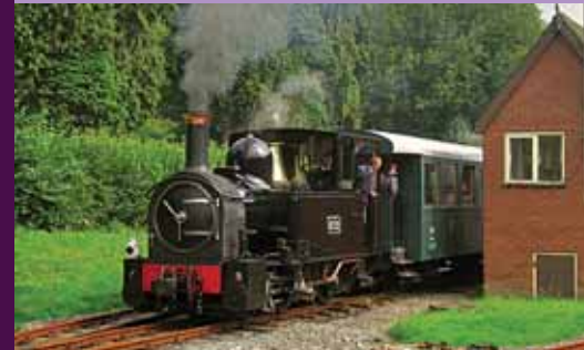
Welshpool & Llanfair Light Railway