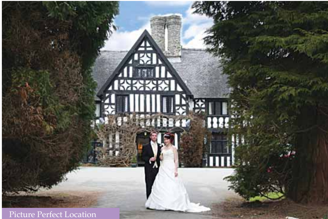
Picture Perfect Location

We have the facility to accommodate any number up to 120 sit down guests for your wedding breakfast and a maximum of 200 guests for your evening reception.