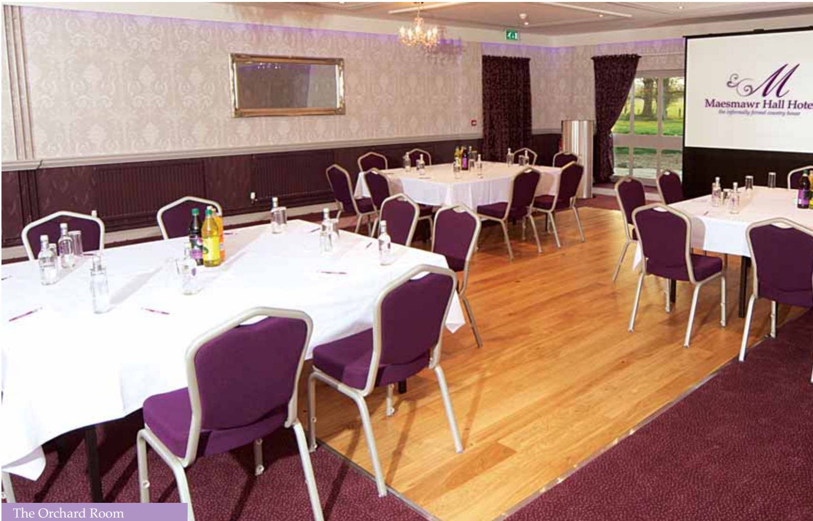
The Orchard Room