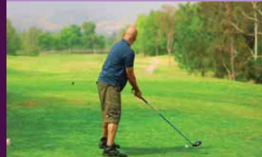
Mid Wales Golf Club