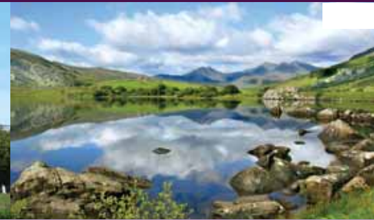
Snowdonia National Park